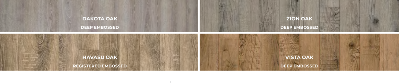
EASY CLICK RESILIENT Versatile. Sensible. Effortless. technology. will void your warranty.