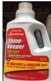
Armstrong's Shine Keeper