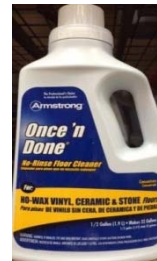
Armstrong's Once 'N Done