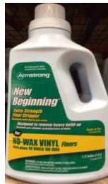
Armstrong's New Beginning