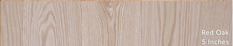
Red Oak 5 Inches