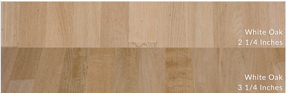
White Oak 2 1/4 Inches

These floors are waiting to be custom stained and finished to meet your needs and suit your distinct style!