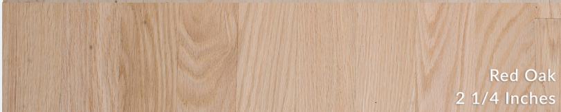
Red Oak 2 1/4 Inches